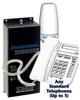
SKYCONNECT INDOORS Item #: SCIND

Includes: High-Capacity Battery; AC Power Adaptor; International Plug Kit; DC Power/Car Adaptor; Portable Auxiliary Antenna; Antenna Adaptor; Earpiece; Leather Holster; Lanyard Wrist Strap; and, User Guide.