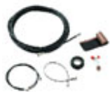
8 METER MAIN CABLE Item #: C2-NMNF-8M

For use with the 9505A Portable Phones to deliver exceptional reception performance for permanent in-building or marine applications. Designed for free air operation (no ground plane).